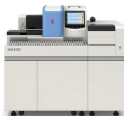
AIA-900 with 9 Tray Sorter Also available with 19 tray sorter option and as Loader model